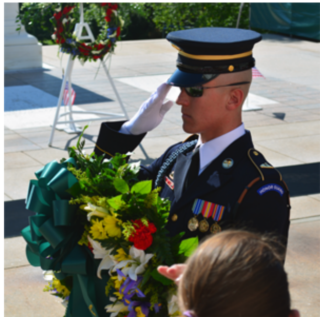
Honor Guard at the Tomb of the Unknowns. Red Warriors presented a wreath during the 2012 Reunion. Watch video

Registration information is on our website. Registration Page Deadline drawing near!